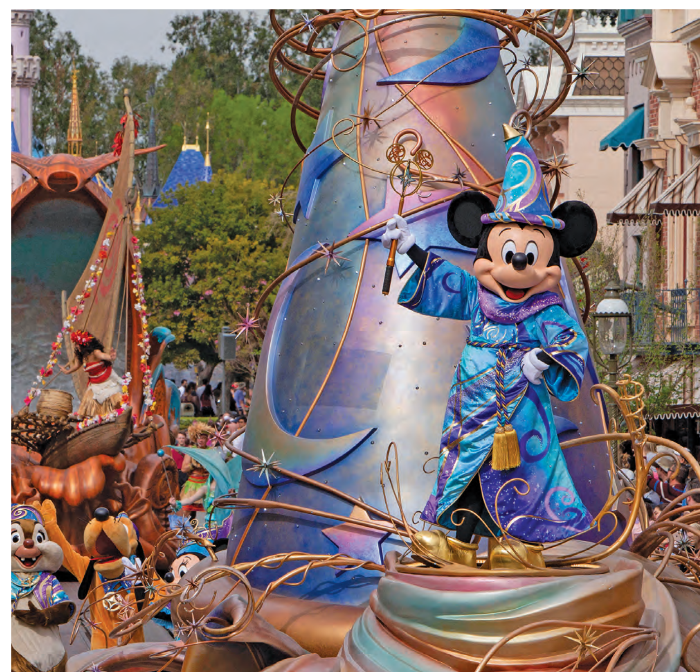
THE "MAGIC HAPPENS" PARADE MAKES ITS HIGHLY ANTICIPATED RETURN TO DISNEYLAND PARK ON FEB. 24 AS PART OF THE DISNEY100 CELEBRATION.

Mickey & Minnie's Runaway Railway will be joined by additional new experiences and returning favorites when the reimagined Mickey's Toontown reopens on March 8. The beloved land will feature more play activities and attractions than ever before, as well as grassy play spaces for guests to unwind.