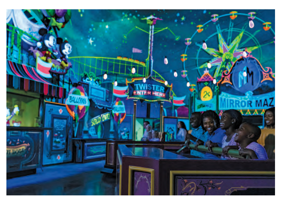
MICKEY & MINNIE'S RUNAWAY RAILWAY IS NOW OPEN AT DISNEYLAND PARK IN THE REIMAGINED MICKEY'S TOONTOWN, WHICH OPENS IN MARCH.