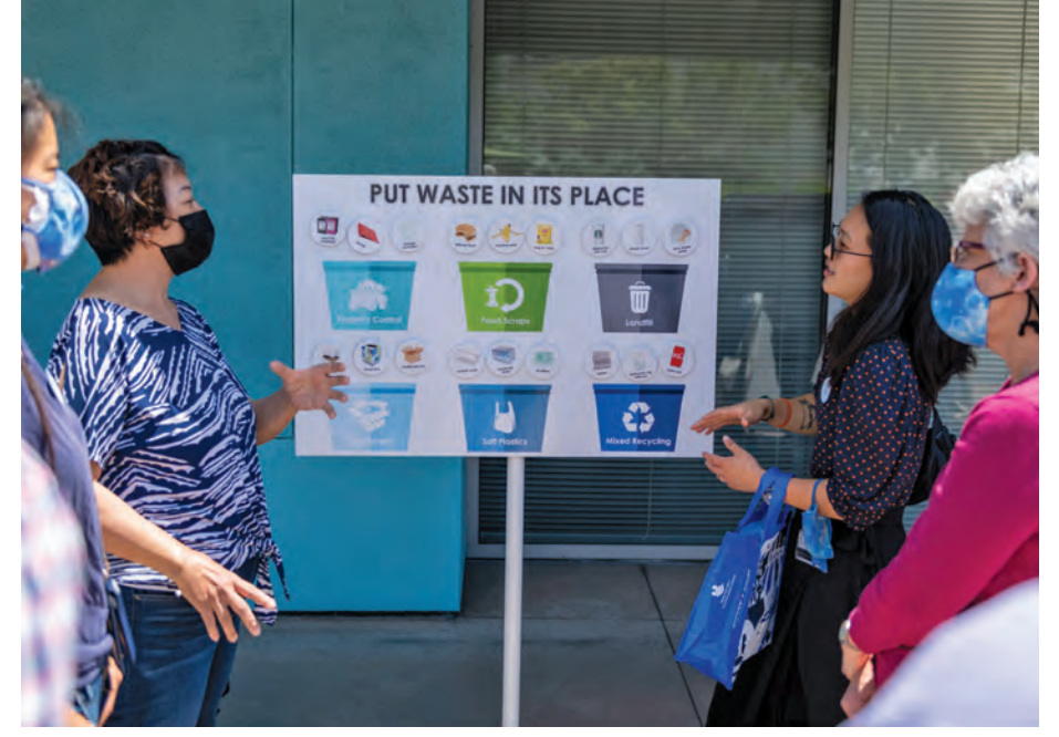
DISNEYLAND RESORT CAST MEMBERS LEARN HOW TO PROPERLY SORT WASTE AT A LAUNCH EVENT FOR PROJECT ZERO.

This innovative project helped the resort earn a 2022 SEAL Business Sustainability Award. SEAL (honoring Sustainability, Environmental Achievement and Leadership) is an environmental advocacy organization that celebrates