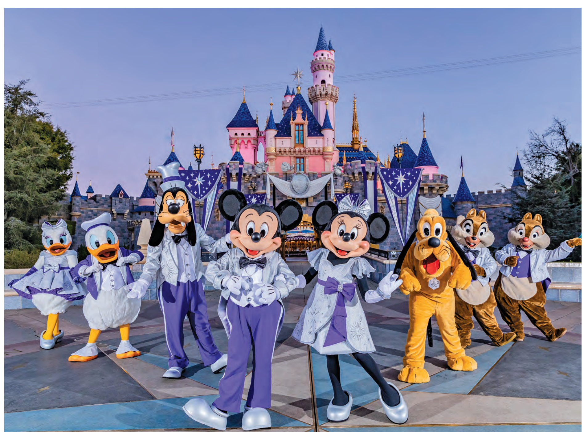
THE DISNEY100 CELEBRATION AT DISNEYLAND RESORT JUST BEGAN WITH EXCITING OFFERINGS PLANNED THROUGHOUT 2023.