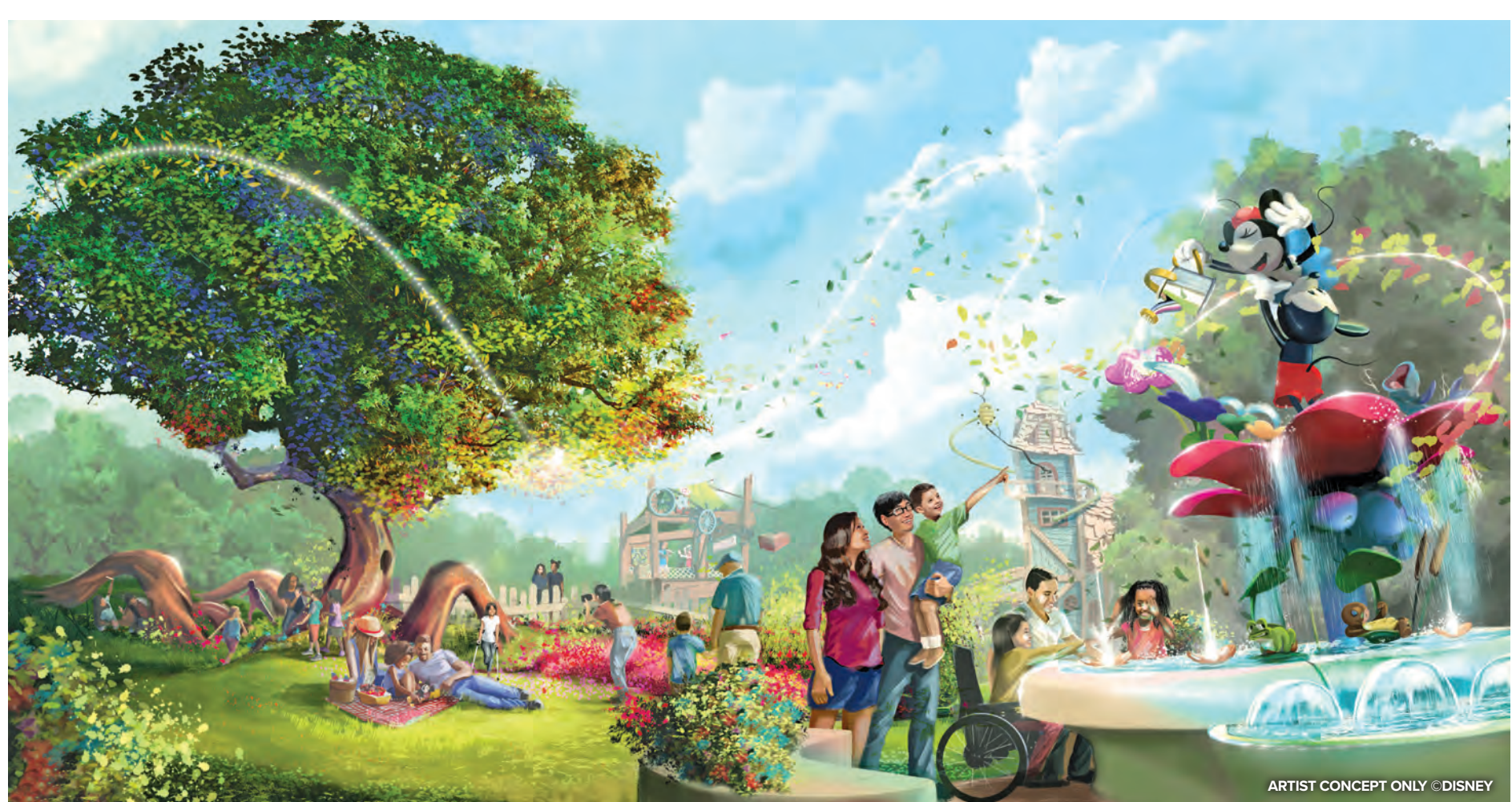
THE REIMAGINED MICKEY'S TOONTOWN REOPENS ON MARCH 8 AND IS HOME TO NEW EXPERIENCES AND RETURNING FAVORITES FOR ALL AGES.