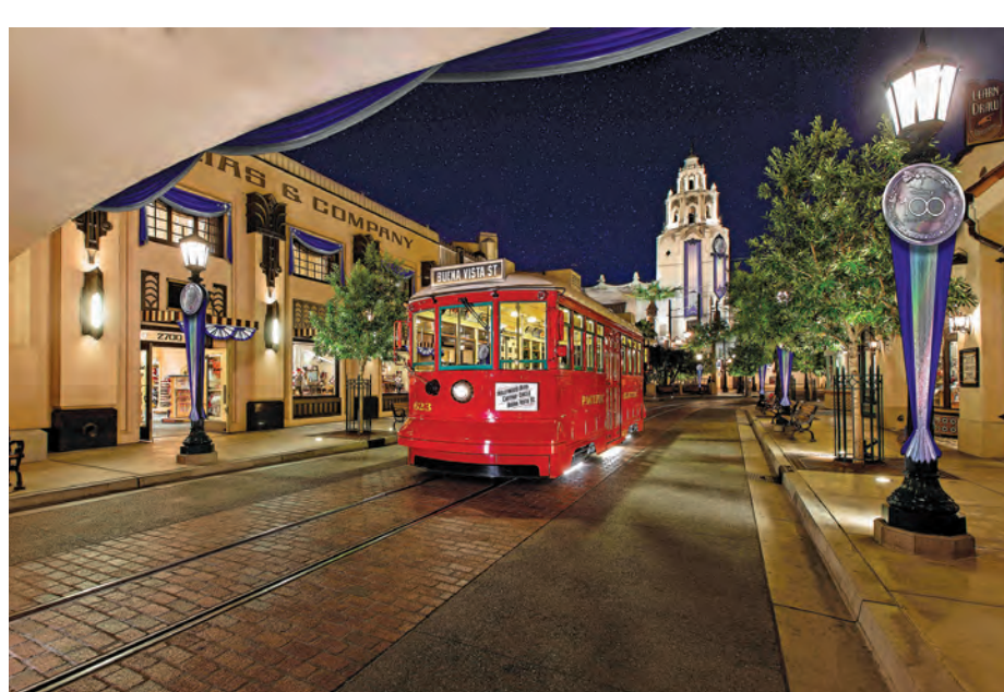
SPECIAL PLATINUM-INFUSED DÉCOR AND PHOTO OPPORTUNITIES WILL BE ON DISPLAY AT THE DISNEYLAND RESORT THROUGHOUT THE DISNEY100 CELEBRATION.